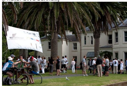
A perfect evening for the NZ Marine Cup BBQ after a great day's sailing