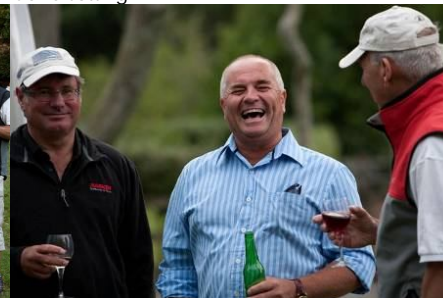
The Kiwi Kawau Challenge proved a most enjoyable day and evening for all involved