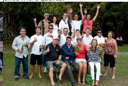
Shenandoah's happy crew enjoy the Kawau Island setting