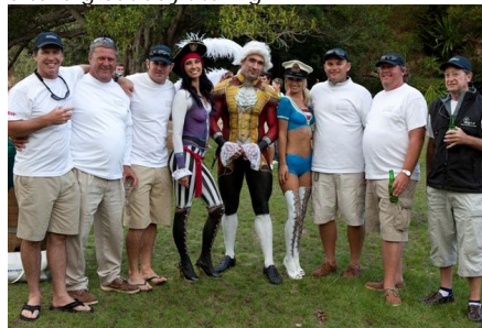
The crew of Drumbeat with the amazing body-painted models