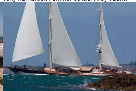
NZ Marine Millennium Cup competitor Thalia joined in for a quick sail