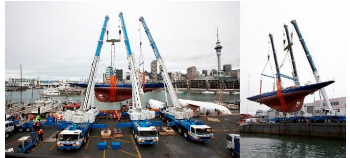
Endeavour coming out of the water in Auckland in February

traditional boat enthusiast, owning and racing the iconic 60 foot Ranger of Auckland ."