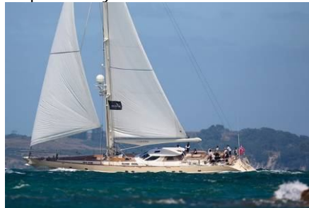
Celandine set a handy pace to take the NZ Marine Cup win on handicap