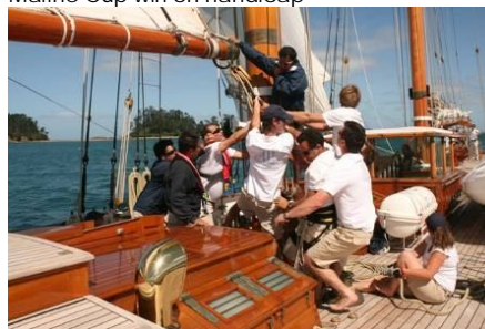
It's literally all hands on deck on Shenandoah